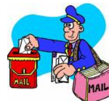
Detail of one part

The Golgi Bodies are like the post office because it packages/transport materials just like the post office packages and transports mail.